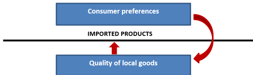
Fig. 3. Scheme of consumer preference management.

The management of consumer preferences, especially in the situation of import substitution, should be reduced to encouraging local producers to improve the quality of their products, bringing them as close as possible to the corresponding characteristics of their foreign analogues (Fig. 3).