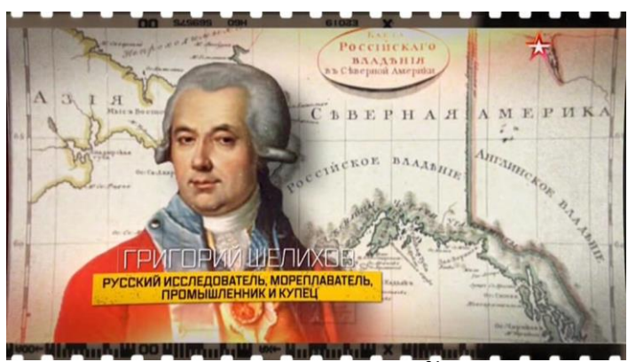
Fig. 3. Grigoriy Shelikhov<sup>24</sup>

about the northwestern half of North America, called Russian America. Major geographical discoveries of the 18th century in North America were made by Russian sailors [4, Zubov N.N.]. "Only thanks to the exploits of Russian explorers of the 17th century (most of whom, by the way, came from the basins of the Northern Dvina and Onega), Bering's voyages of the 18th century and further expansion to America of the Russian Empire, followed by the expansion of Britain and Spain,