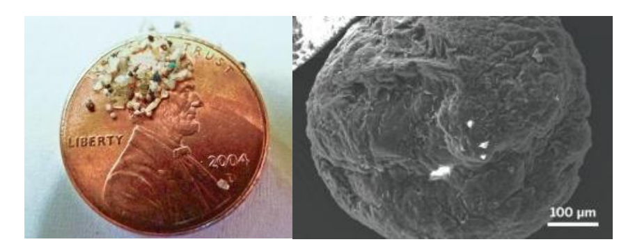
Fig. 1. Microplastic from cosmetics.

Microplastic contained in cosmetics and formed during washing gets in wastewater. The main problem is that microplastics are so small in size (Fig. 1) that they are not captured by wastewater filtration systems, and, as a result, these particles enter water bodies and become an environmental hazard [1].