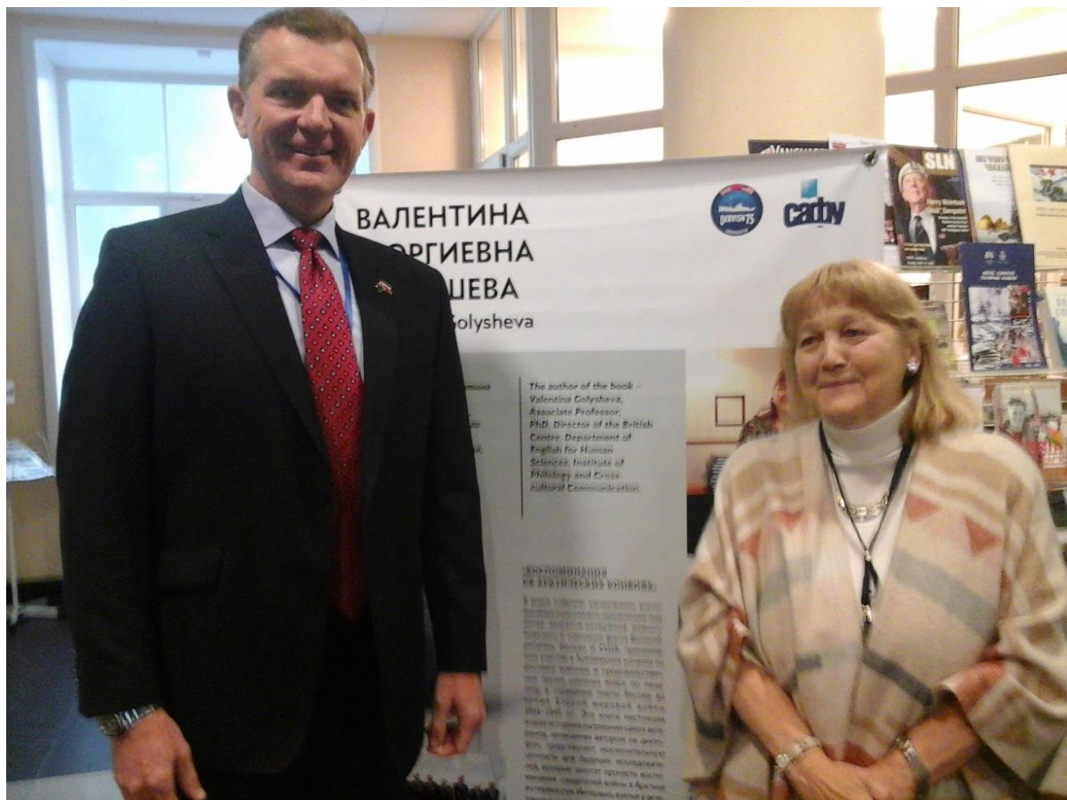
Figure 5. Peter Tash, the Australian Ambassador, at Forum in NArFU