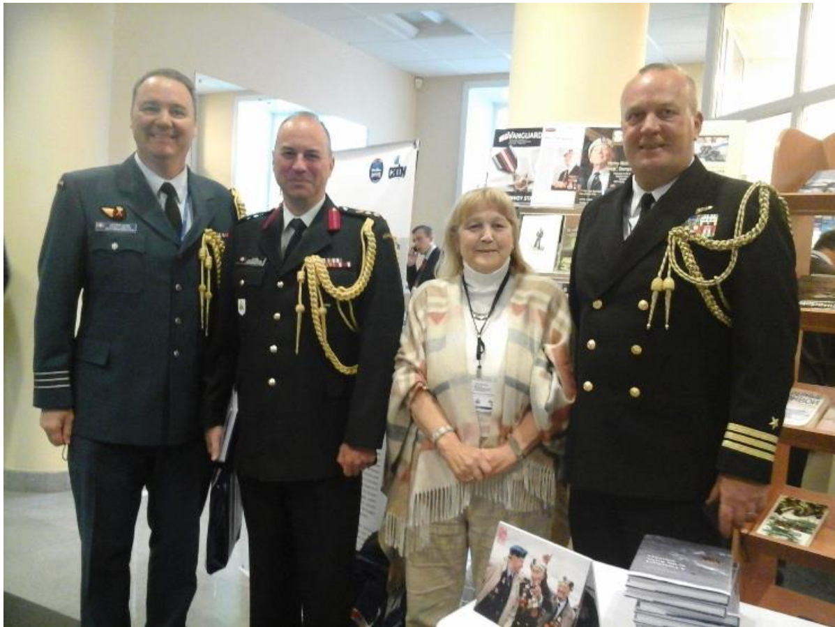
Figure 4. Military Attaché of the Canadian Embassy at Forum in NArFU