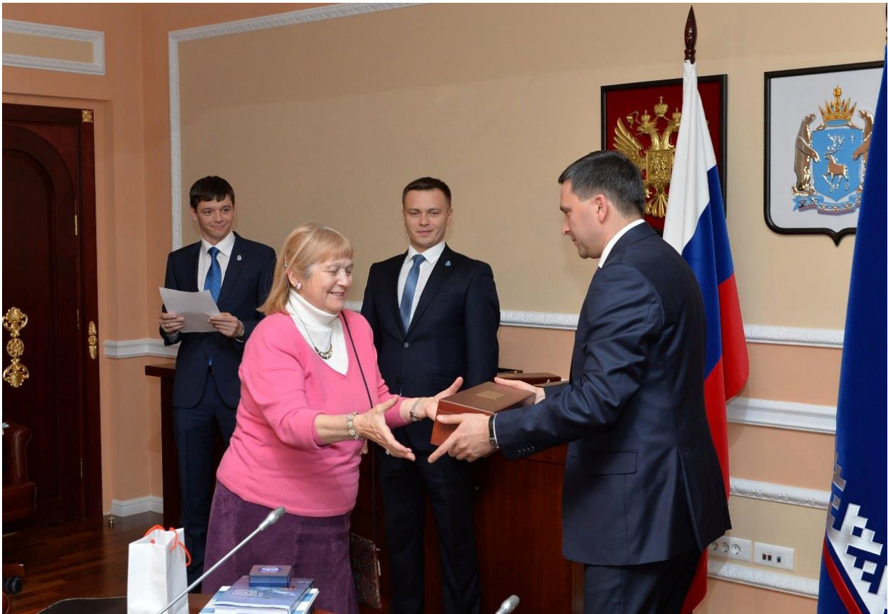
Figure 9. Handing over the capsule by the Governor of YaNAD, D.N. Kobylkin