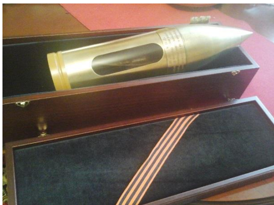
Figure 3. The capsule with sea water from the Kara Sea, from the site of the death of the vessel "Marina Raskova"

the remains reburied on the Island Bely.