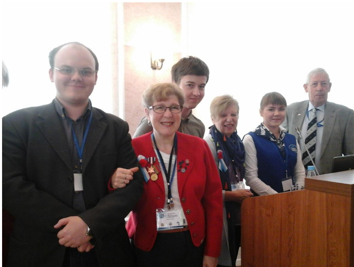
Figure 7. The British participants of Forum with students of NArFU