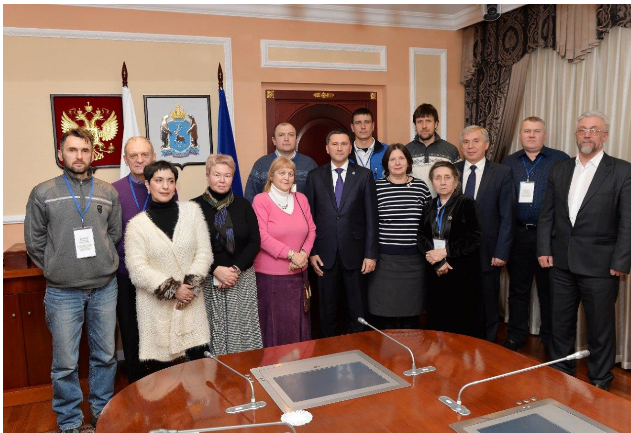
Figure 12. General photo at the reception of the Governor of YaNAO