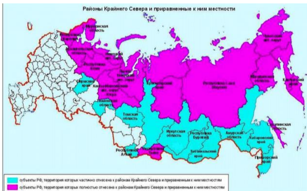
Figure 2. Far North areas of Russia. URL: http://meridian12.ru/wp-content/uploads/2014/04/север-России.gif

Far North includes the entire Arctic, and the Arctic called only a part of the northern territories and waters. In the public administration of the USSR — the RF concept far North used since 1930 biennium till now.