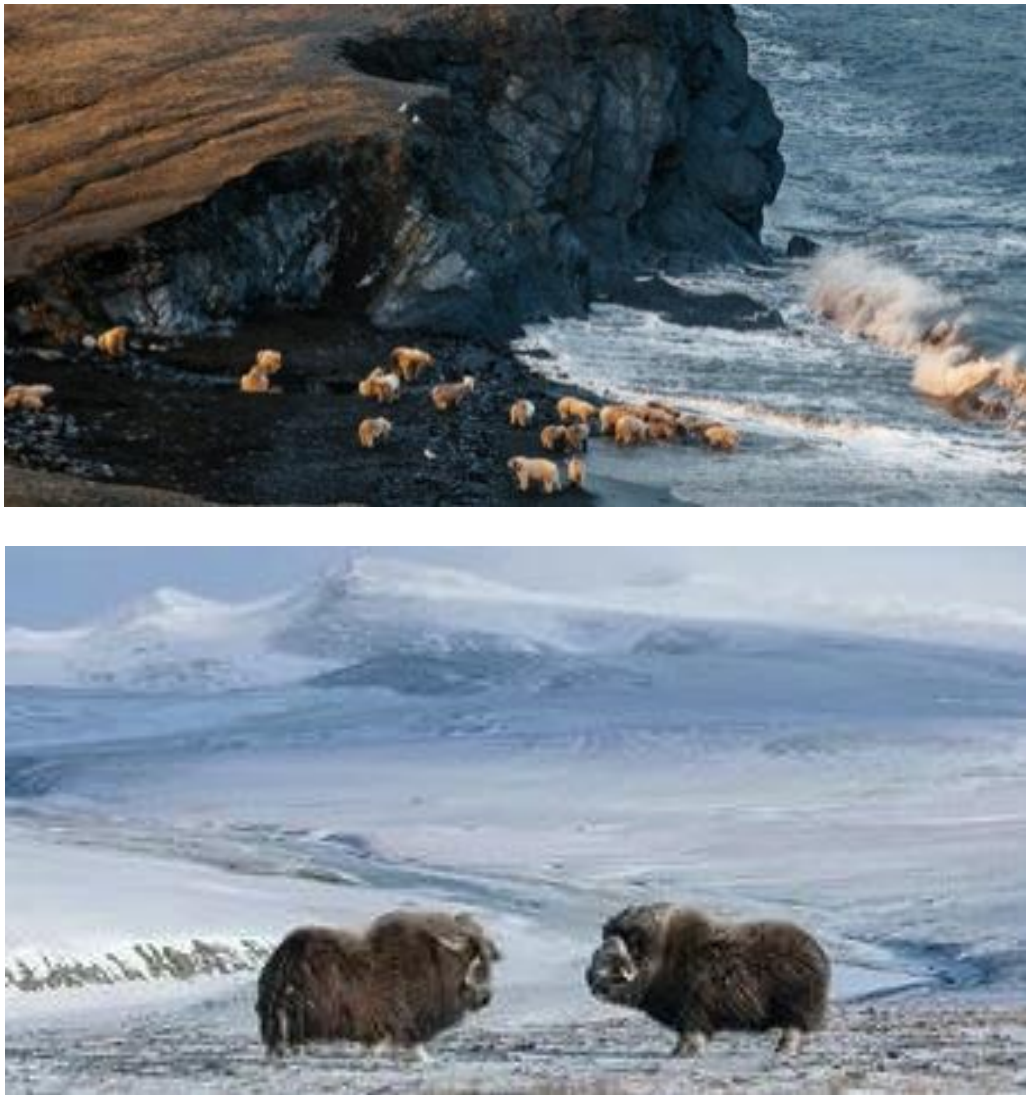
Figure 5. Vrangeli island – the UNESCO object