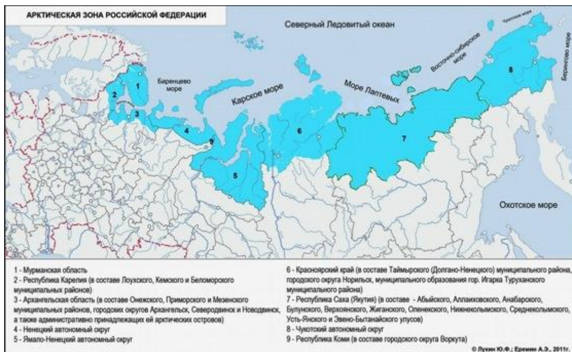
Figure 1. The AZRF map / Lukin Yu.F., Eremin E.S., 2011

“Russian Arctic” , in my understanding, is the internal maritime waters, exclusive economic zone, waters of the Barents, White, Kara, Laptev, East Siberian, Chukchi, Bering Sea, the continental shelf, in accordance with the UN Convention on the law of the sea; the waters of the Northern sea route as the historic national transport communication of the Russian Federation; all discovered here, and may be discovered in the future; land and Islands, located in the Arctic Ocean; inland northern territories of the subjects of the Russian Federation and Municipal formations on the coast of the northern seas, with exits to the water areas of the Arctic Ocean, the Russian State security; airspace”.