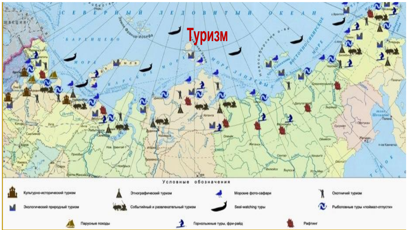
Figure 6. Tourism map / Shevchuk A.V., St. Petersburg, November 2014.

2. the unique flora and fauna of the army of the northern territories, the Arctic islands and waters of the Arctic Ocean allows implementing attractive tourist routes, sea cruises with demonstrations of wild animals in natural conditions (polar bears, walruses, birds ' bazaars, etc.).