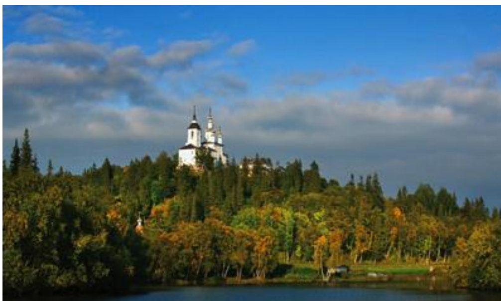
Figure 4. Solovky islands: Golgopha; channels between the lakes

only place in the country where every year and hosts year-round observation of cetaceans 12 . Among the sea of SPNT so far appeared newly created in 2013. "Beringia" National Park with a total area of 1.8 million hectares. Under international protection there are twelve of the fifteen cetaceans. Greenland and grey whales are distributed to native quota International Whaling Commission indigenous people of Chukotka — the Inuit and Chukchi. Known archeological monuments — "Whale Alley" Eagle "Pajpel'gak housing Ekven», but more than 200 are still stored in a mystery thousands of years waiting for archaeologists and ethnographers. Sea gradually picks up with this piece of material culture 13 on the coast of the White Sea was created and operates the National Park" pomorye "Onega (2013).