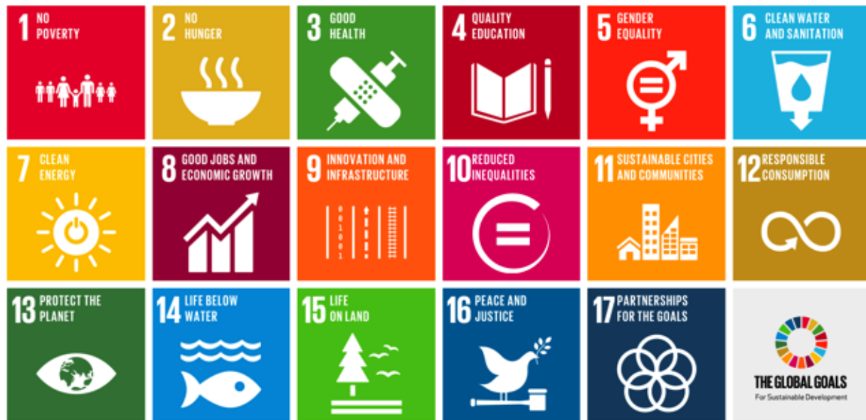
Figure 7. UN: 17 goals of sustainable development // Global Sustainable Development Report, 2015 edition

The overall conclusion is that effective practical activities, quality service in the field of tourism in the Russian Arctic — still the case for the near future in the time interval from 10 to 15 years, and maybe more. A lot depends here on the existence of demand for local products in the Arctic, the prevailing conditions in the market of tourism services, the volume of investment in infrastructure development in the Arctic regions of the Russian Federation, the positions of the Russian State, regional and municipal authorities and management of domestic business, from effective operation of tourism operators and agencies themselves.