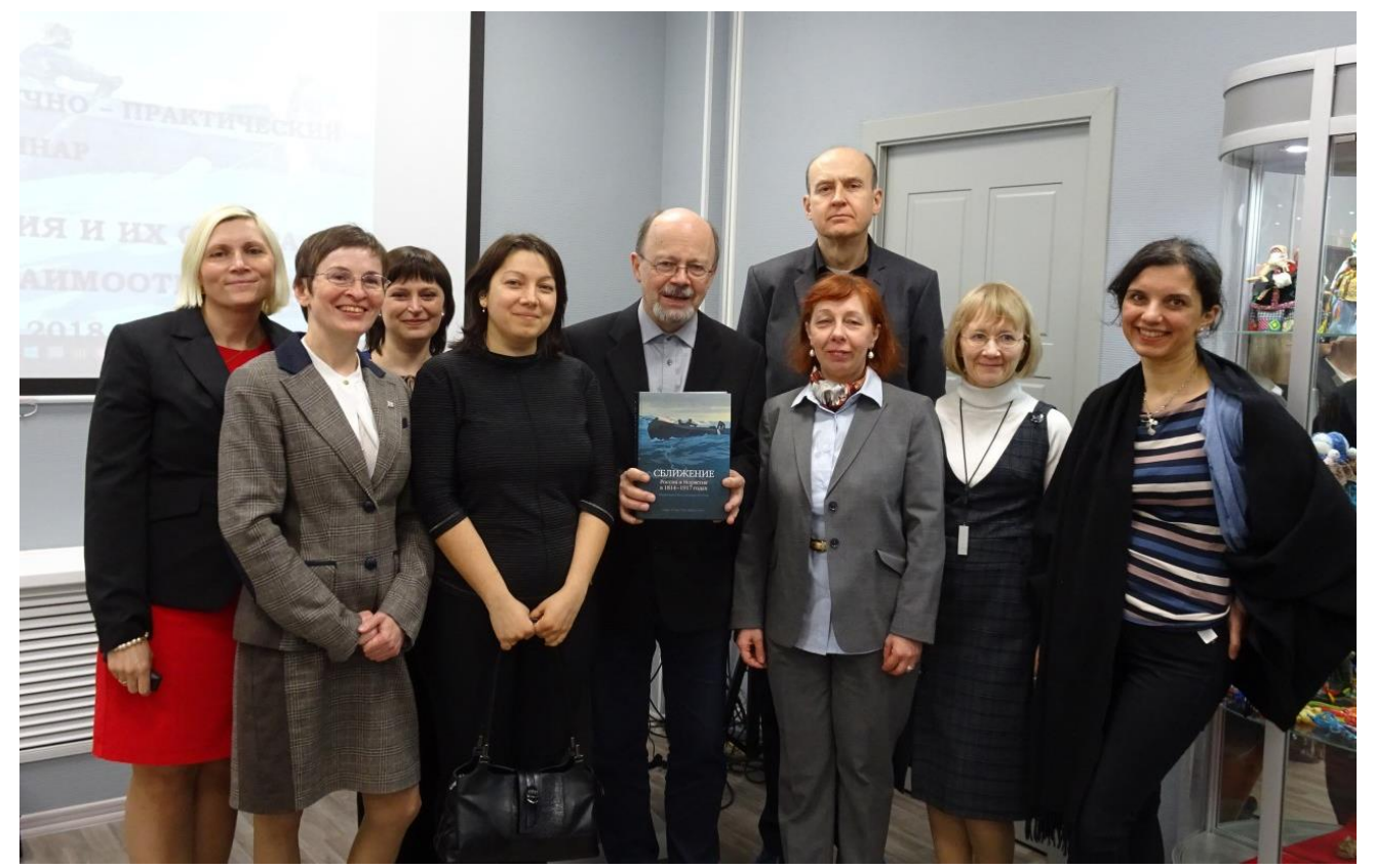
Fig. 4. Participants of the international scientific seminar "Russia, Norway and their North. Historical Relations" at the Historical and Local History Museum of the Pechenga District of the Murmansk Region, the border town of Nikel, April 25, 2018.