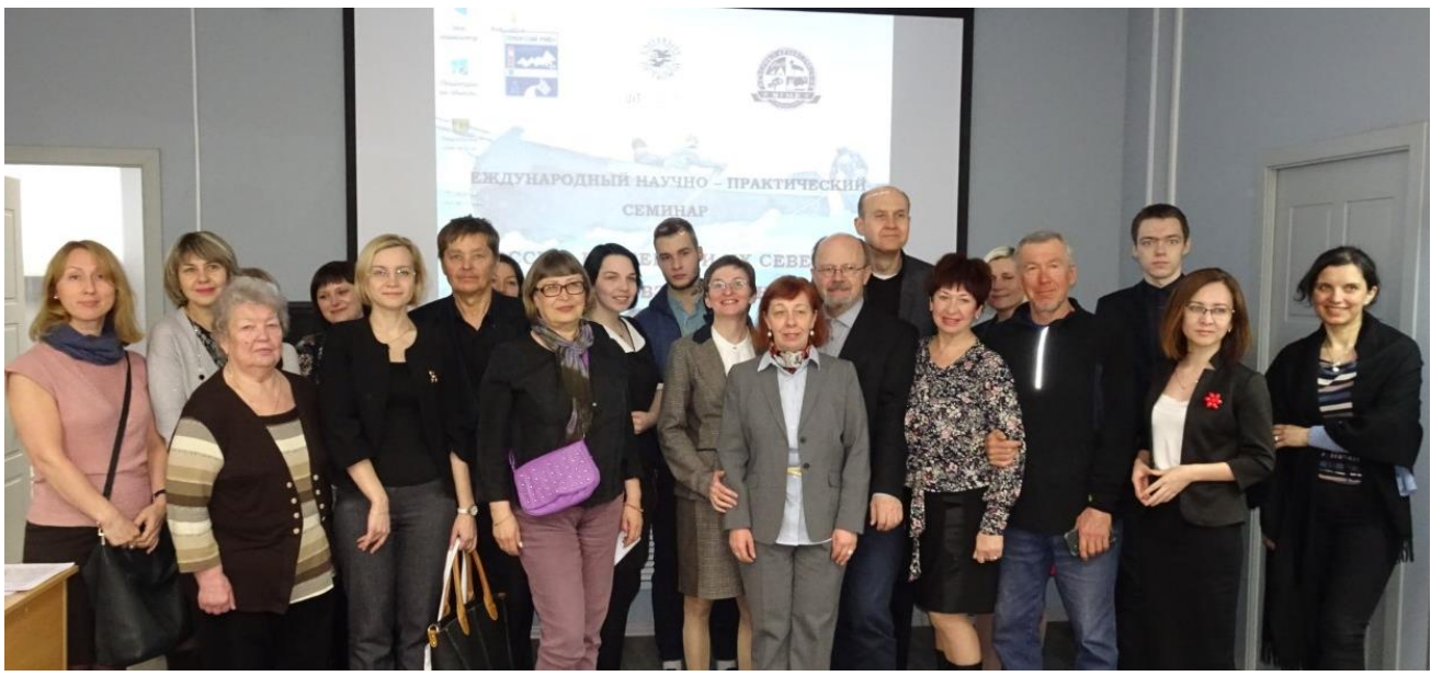
Fig. 3. Speakers and residents of the towns of Nikel and Zapolyarny at the international scientific seminar "Russia, Norway and their North. Historical Relations" at the Historical and Local History Museum of the Pechenga District of the Murmansk Region, the border town of Nikel, April 25, 2018.