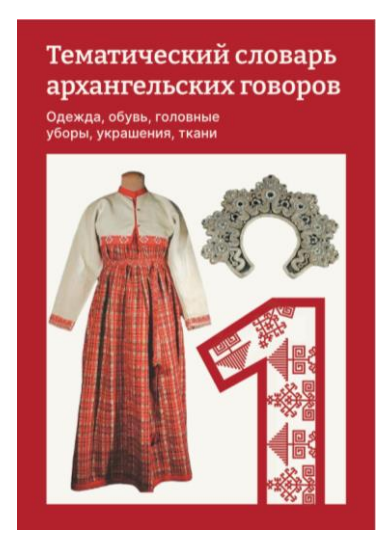
Fig. 1. First edition.

"Traditional northern dishes and drinks and methods of their cooking" (Fig. 3) were published in 2024 [4; 5].