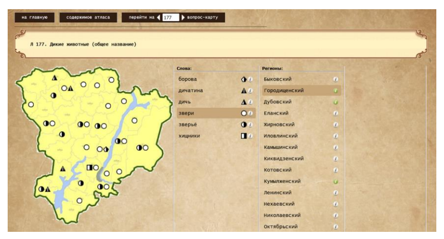
Fig. 8. Question map "Wild animals" in the lexical atlas of the Volgograd Oblast.

The options presented above demonstrate thematic design. In the thematic dictionary of Arkhangelsk dialects, voluminous thematic categories are highlighted, the words related to them are difficult to display on the map due to their number. Therefore, a different approach was used in developing the lexical atlas of the Arkhangelsk Oblast: a word or several words specified by the user are directly placed on the map (Fig. 9).