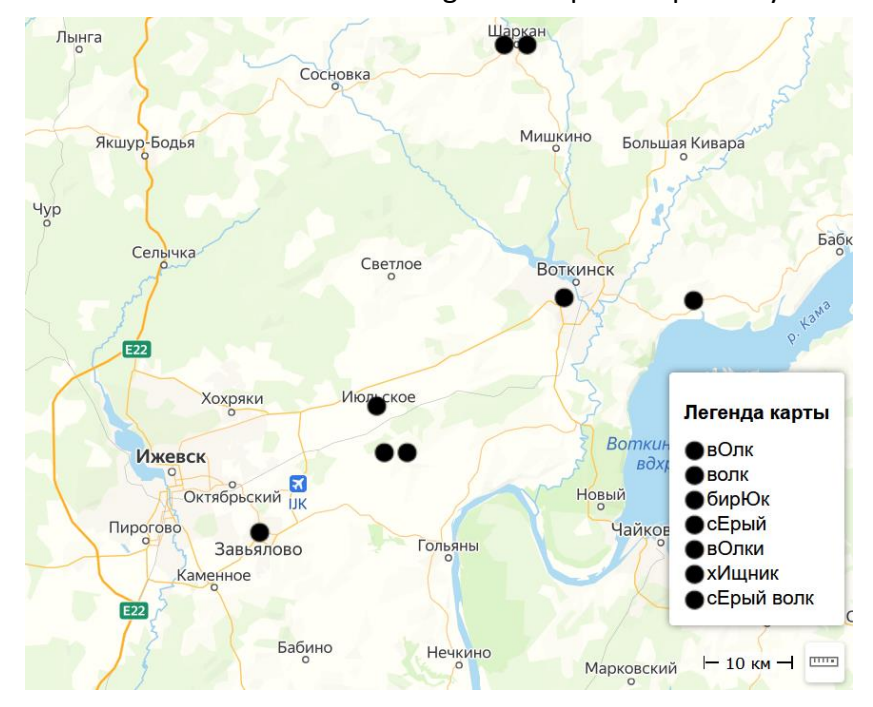
Fig. 7. Map of the distribution of words related to the theme "wolf" in the linguo-geographical system "Dialect".

A similar system has been implemented by the Laboratory of Information Technologies for Education at the Volgograd State Pedagogical University. The lexical atlas of the Volgograd Oblast [9] is based on pre-designed question-maps. Each such map reflects, firstly, dialect words united by a common theme (for example, "wild animals"); secondly, the areas in which these words are found. The areas of use are also marked on the regional map with special symbols (Fig. 8).