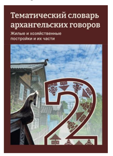
Fig. 2. Second edition.