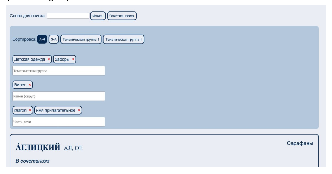
\label{prop:continuous} \textit{Fig. 5 "Electronic thematic dictionary of Arkhangelsk dialects"}.

The found words can be sorted in direct or reverse alphabetical order, in direct or reverse order by thematic groups.