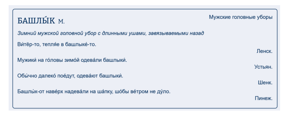
Fig. 6. Dictionary card.

The electronic dictionary entries are presented in the form of dictionary cards. The word, its grammatical characteristics, and thematic group of the card are highlighted separately. The main section of the card contains the meaning of the word and examples, divided by districts.