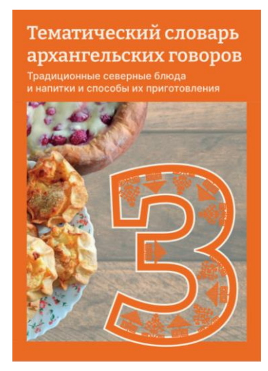
Fig. 3. Third edition <sup>1</sup>.