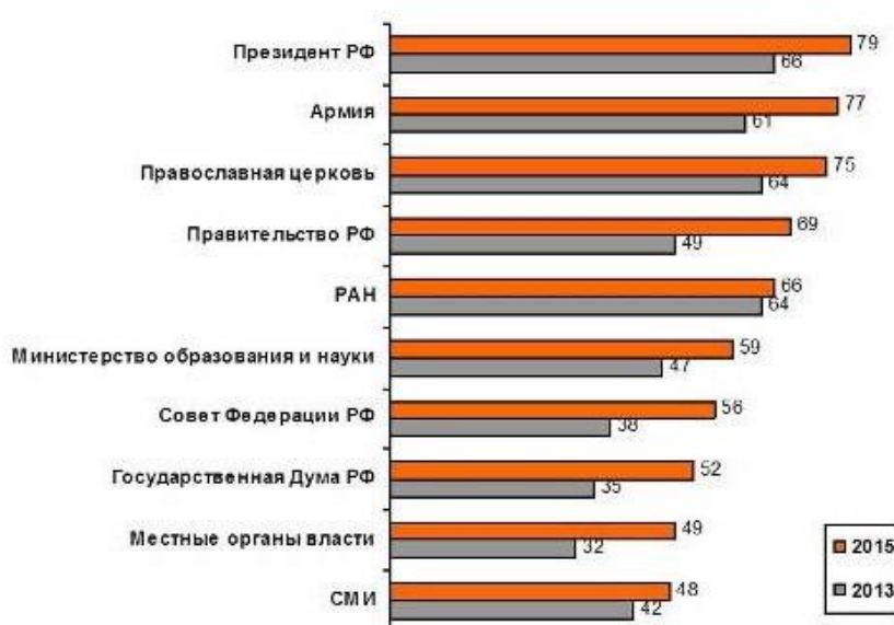
Figure 2. Dynamics of trust for social institutes (%) / «ROMIR», ISPI RAS, March 2015

In March 2015, The Research holding "Romir" and the ISPR RAS Centre of the case studies conducted nationwide poll on trust for various social institutions. Most similar study was conducted in November 2013. The obtained results demonstrate how attitudes of Russians have changed in the past year and a half. During this time, Russians strengthened their confidence in the original principle "for the faith, Tsar and fatherland". More than three quarters of those surveyed expressed confidence to the President, the army and the Orthodox Church and it was 11-16% higher than in 2013 (pic. 2) 9 . Feature of our culture is that the Russian mentality always was positive towards power as a gift of heaven. The people have certain expectations in relation to the power (caring, fairness, resolute struggle against the thieves, embezzlers of state property and other criminals, strengthening the power of Russia and the realization of its purpose in the world) [2, p. 11].